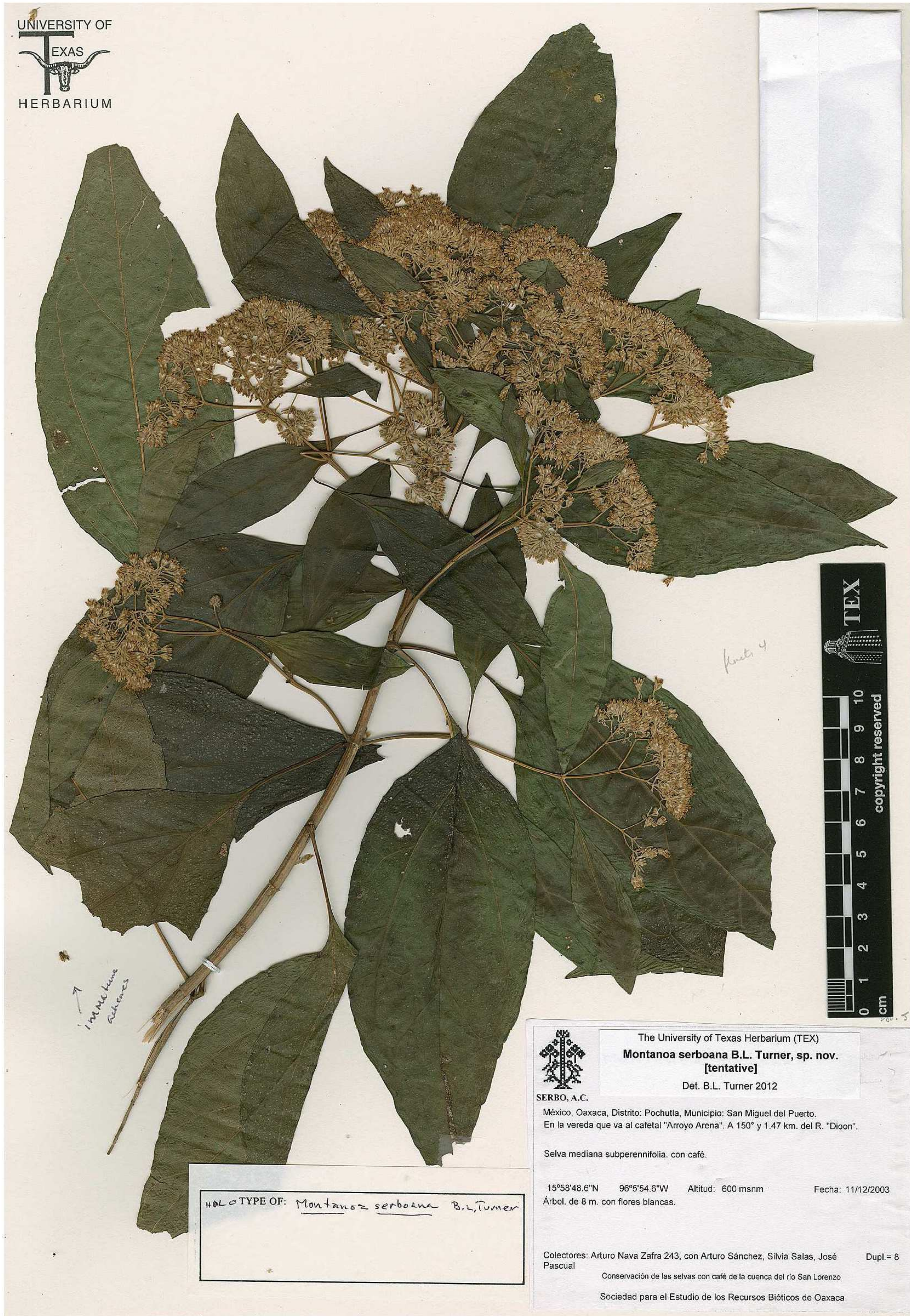
Figure 1. Holotype of Montanoa serboana B.L. Turner.